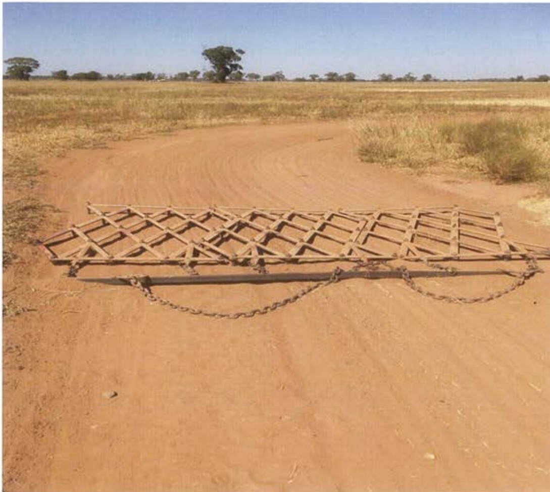
Figure 1 Drag Harrows